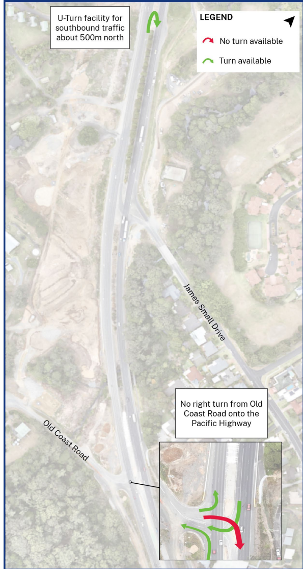
Traffic changes at Old Coast Road

The project team will make further traffic changes in this area in 2024.