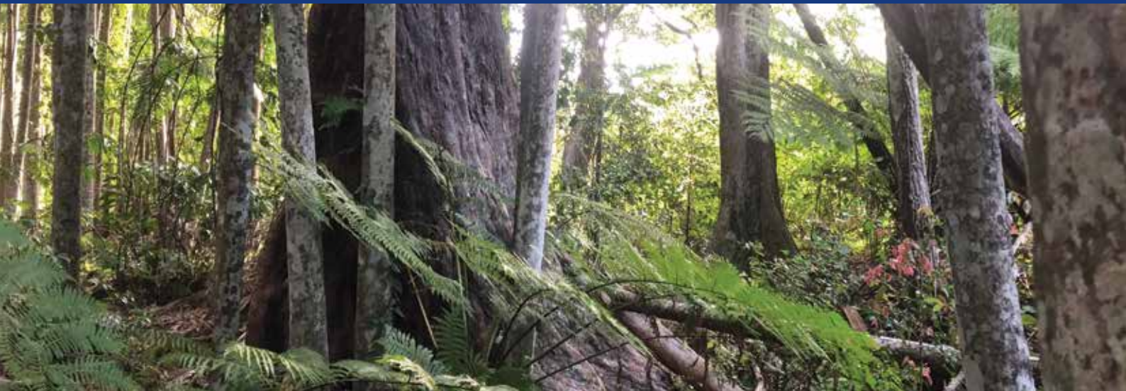
White Booyong Fig Subtropical Rainforest (Grandpa's Scrub)

The Australian and NSW governments are funding the 14-kilometre Coffs Harbour bypass project. The bypass will boost the regional economy and improve connectivity, road transport efficiency and safety for local and interstate motorists.