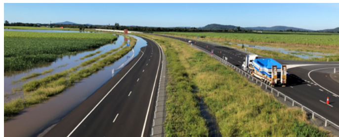
Contraflow arrangement in place at Chatsworth Island during the 2021 floods

event. Using the existing southbound infrastructure created cost efficiencies and ensured local road connections could be maintained for longer during flood events.