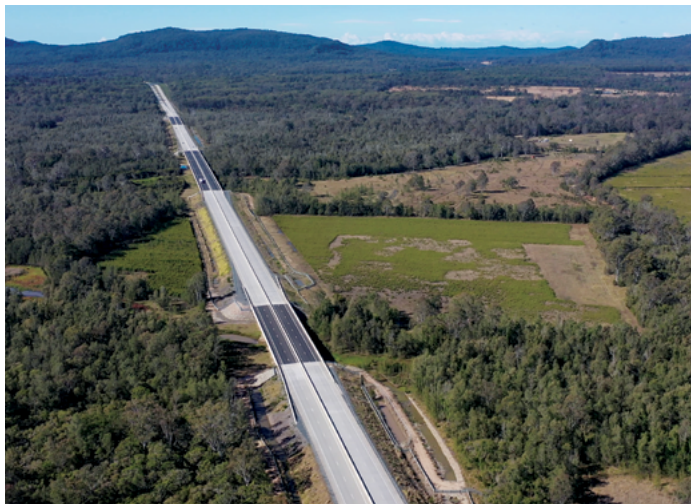
Bridges over the Coldstream, Pillar Valley