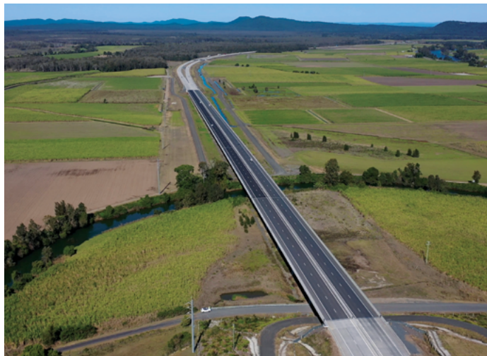
Bridge over Shark Creek, looking south