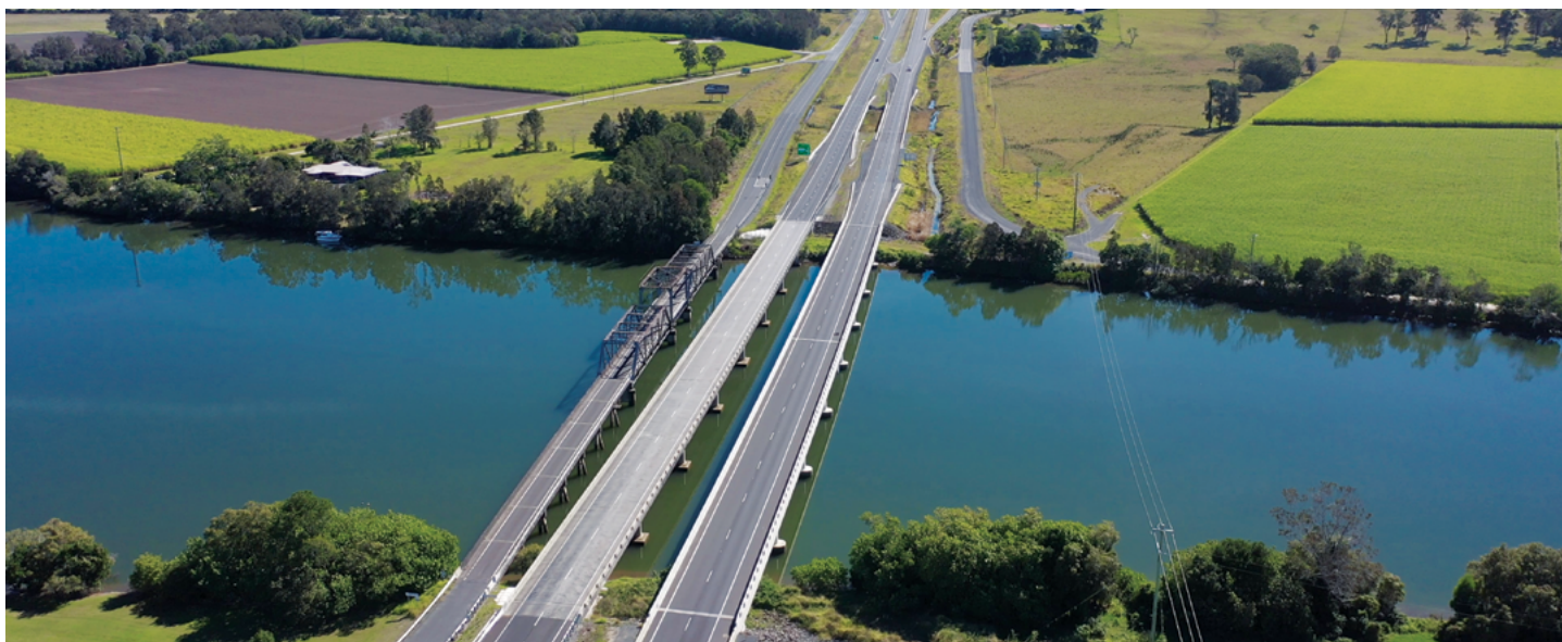
Bridges over the Clarence River North Arm, Mororo