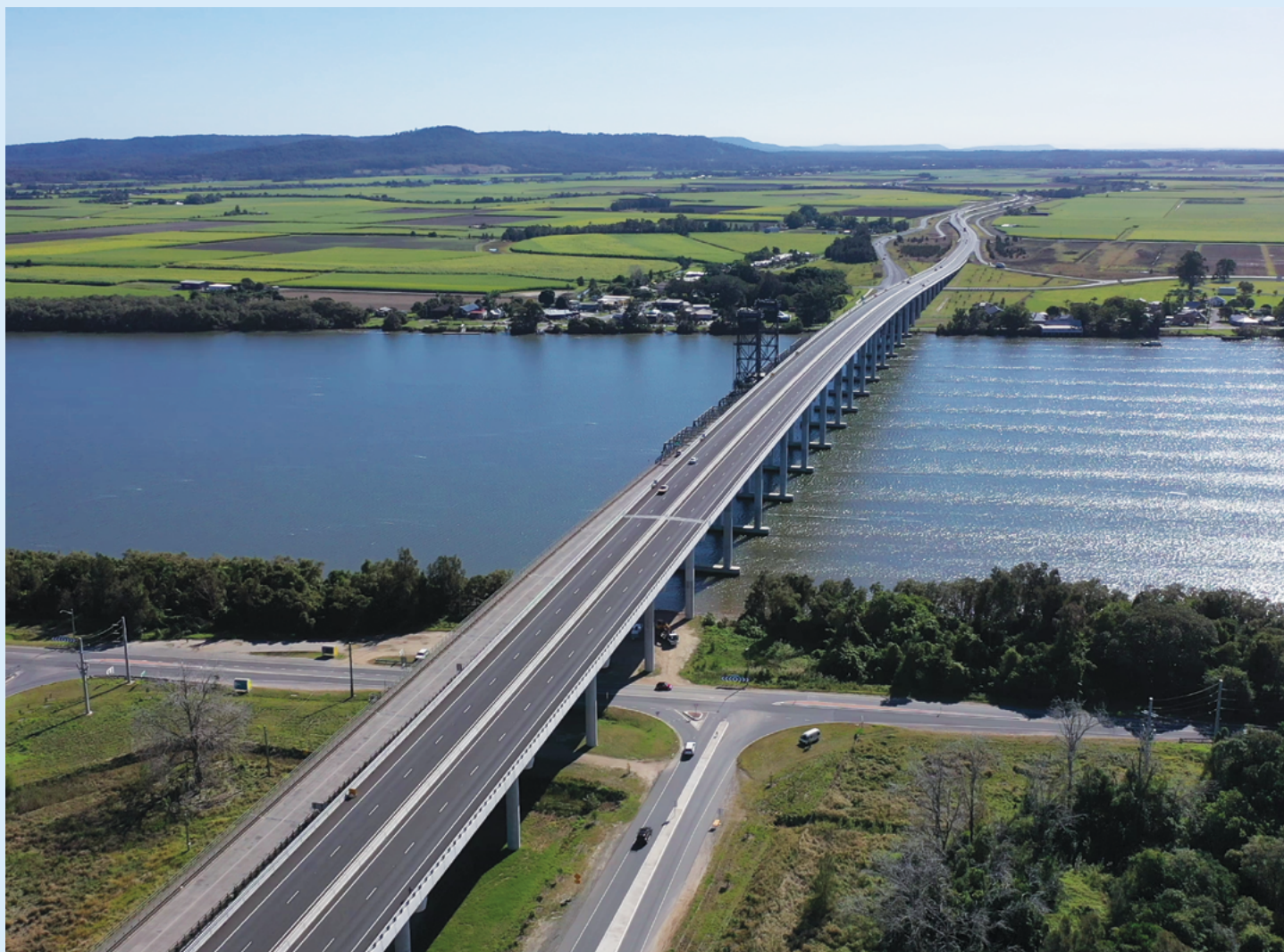
Bridge over the Clarence River at Harwood