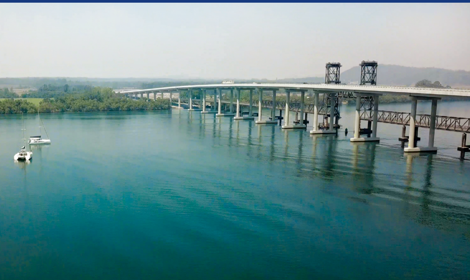
Bridge over the Clarence River at Harwood

The Australian and NSW governments are jointly funding the Woolgoolga to Ballina Pacific Highway upgrade.