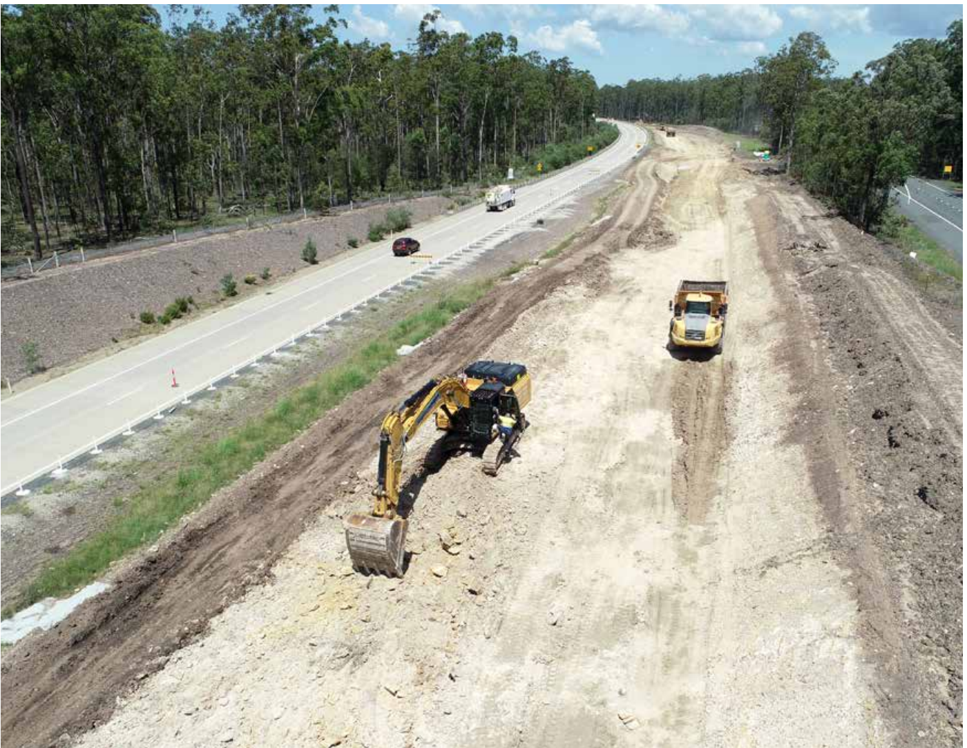
Road work south of Franklins Road

Direct right turn movement into Franklins Road has been removed. Right turn access into Franklins Road will be via a u-turn facility located approximately 750 metres to the north.