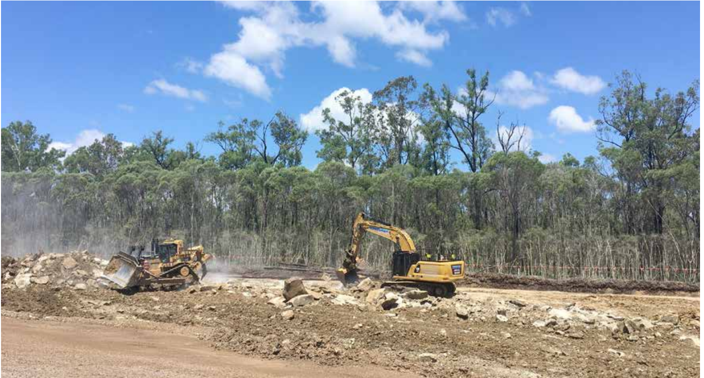
Earthworks north of Franklins Road

Normal construction hours for the project are 7am to 6pm Monday to Friday and 8am to 5pm on Saturday.