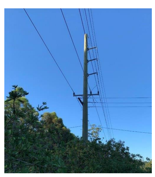
We have commenced replacing poles in the south of the alignment.