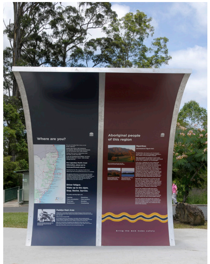
Example of rest area signage

Roads and Maritime is in the process of establishing a state wide road side rest area signage strategy that aims to place local Aboriginal community, cultural and tourism information on panels in rest areas across NSW.