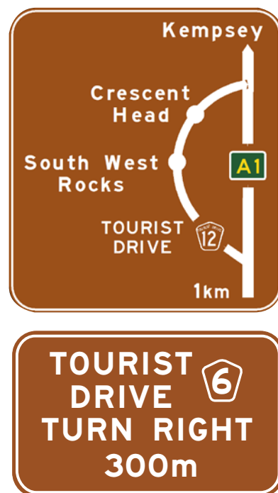
Examples of tourist signposting

See below for examples of tourist signposting.