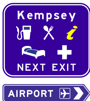
Examples of service signposting

Roads and Maritime works closely with Destination NSW to determine on policy issues regarding service signposting.