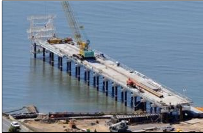
Example of a temporary jetty and piling over water